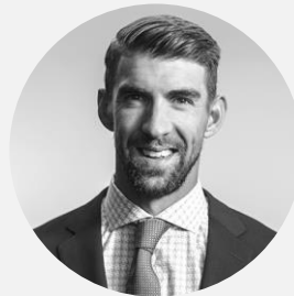
MICHAEL PHELPS Mental Health Advocate