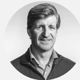
PATRICK KENNEDY Former US Congressman Founder, Kennedy Forum